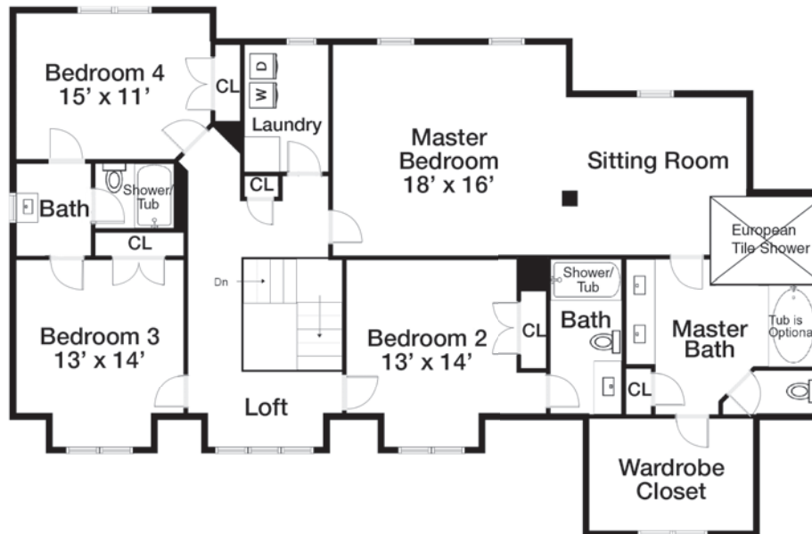
SECOND FLOOR PLAN - 1981 SQ. FT.